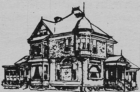
Howe-Waffle House 120 W. Civic Center Dr. Santa Ana