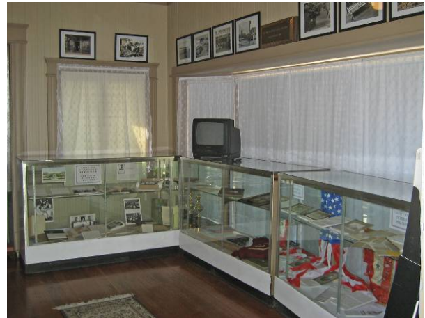
One side of the new Santa Ana Room