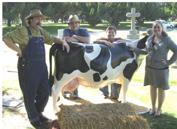
Actors from the 2007 Cemetery Tour pose with their special friend, Clarabell the Cow.

The Society will host our 11 th annual historical cemetery tour, "An Apple a Day: Medical History in Orange County" on Saturday, October 18 th , from 10 am to 3 pm at Fairhaven Memorial Park and Santa Ana Cemetery.