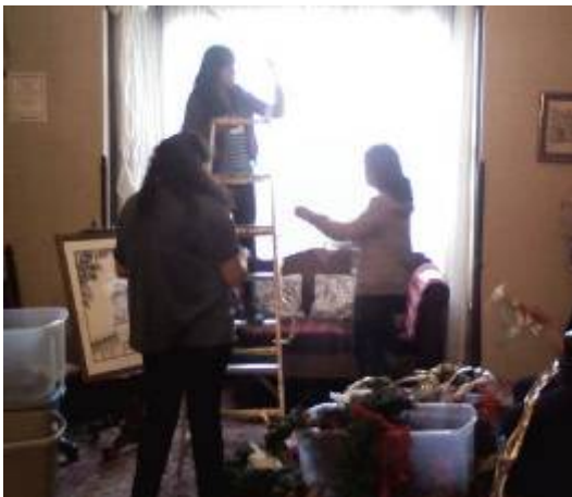
Both photos: Santa Ana High School Key Club members putting up holiday decorations.